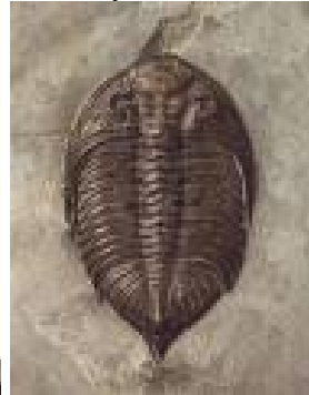
Trilobites Paleozoic Era (540 to 245 mya)