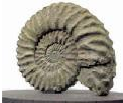
Ammonites Mesozoic Era (245 to 65 mya)

D) _____ Fossil = A fossil that lived during a relatively _____ geological _____ that can be used to find the _____ of the rock layer it is found in.